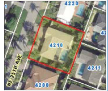
AERIAL PHOTOGRAPH (MAY NOT SHOW LATEST IMPROVEMENTS) (NOT-TO-SCALE)

BEARING REFERENCE: CENTER LINE OF NE 25th AVENUE AS N 21°43'05" E ALL BEARINGS SHOWN HEREON REFERENCED THERETO.